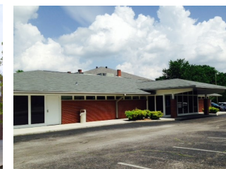
Ooltewah Health Center