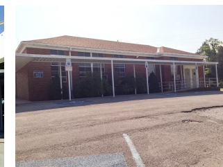
Birchwood Health Center