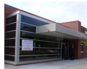
Homeless Health Center