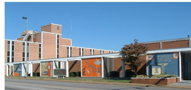
Main Campus - 3rd Street