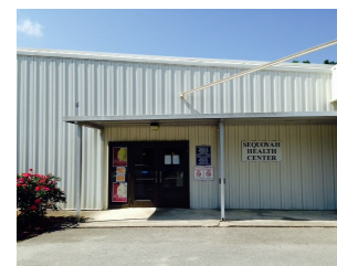
Sequoyah Health Center